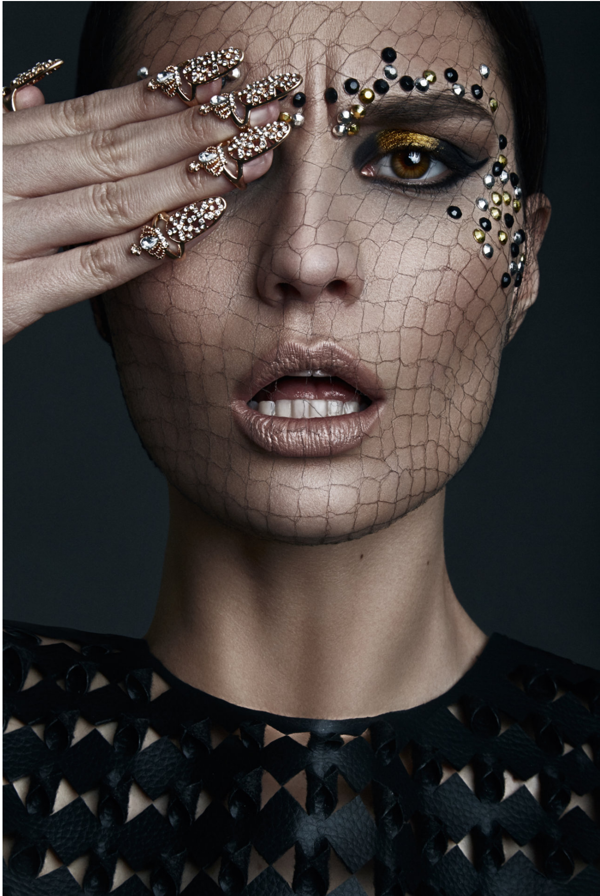
Model: Celine Ps - MUA: Dounia Loud Post prod: David G rivera